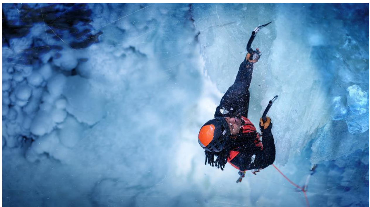
Reel Rock 15: Black Ice