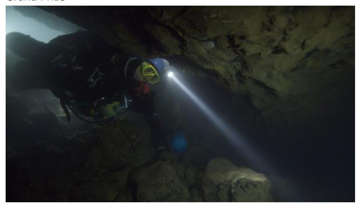
Sponsored by Doña Paula | $4,000