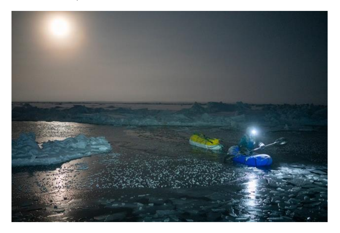
Sponsored by Monod Sports | $2,000