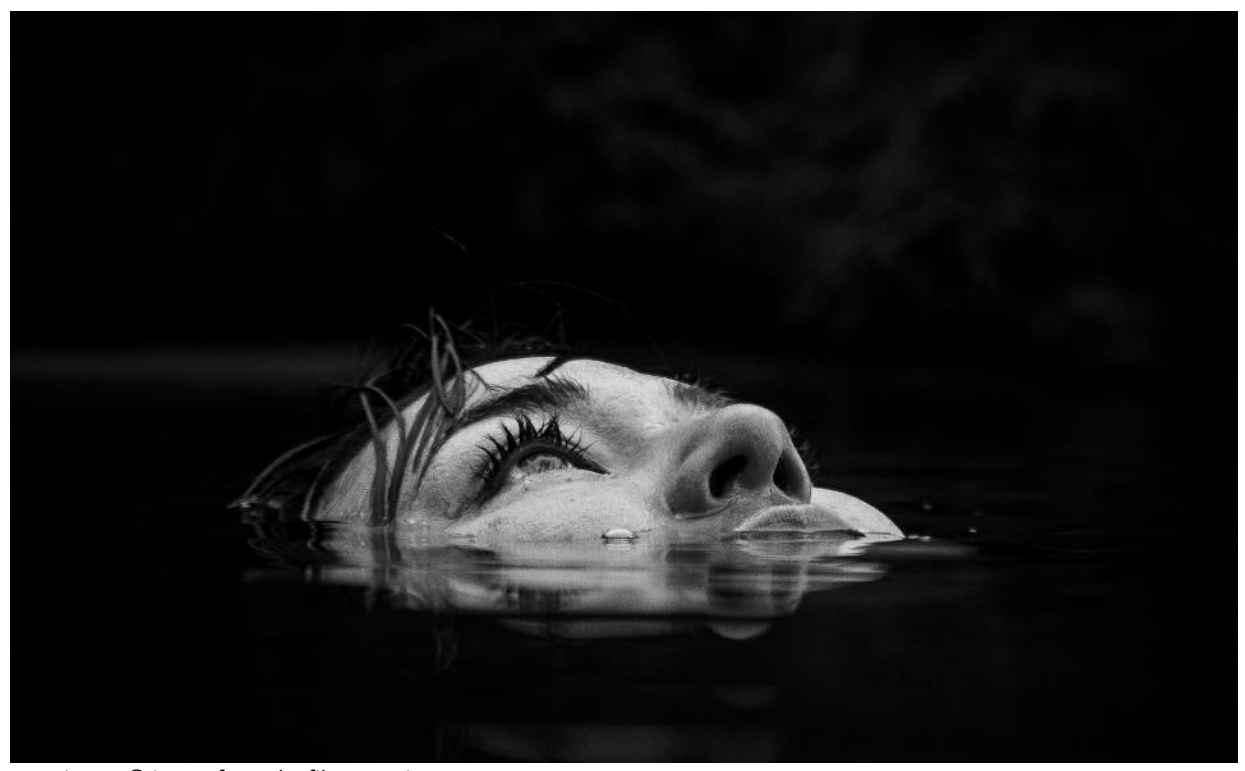
Jess Kimura © image from the film Learning to Drown