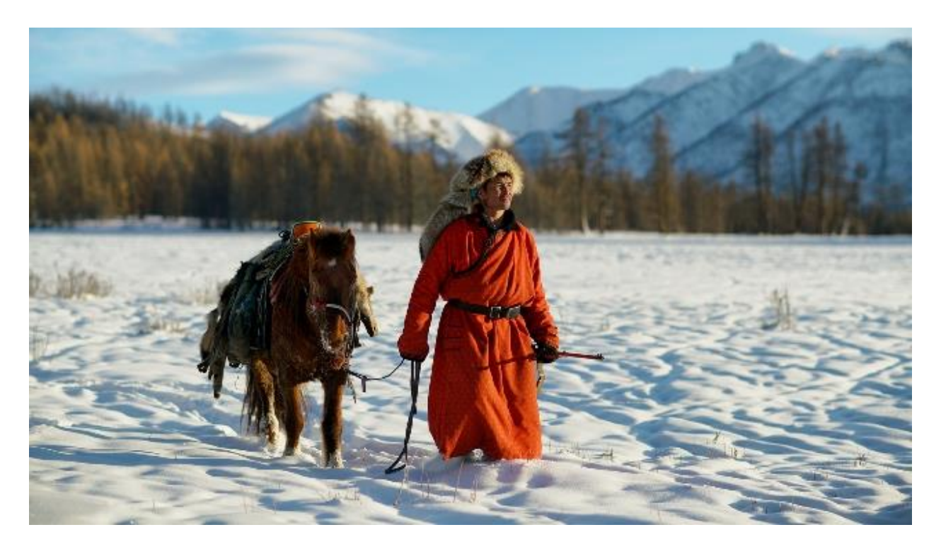
Sponsored by Helly Hansen | $2,000