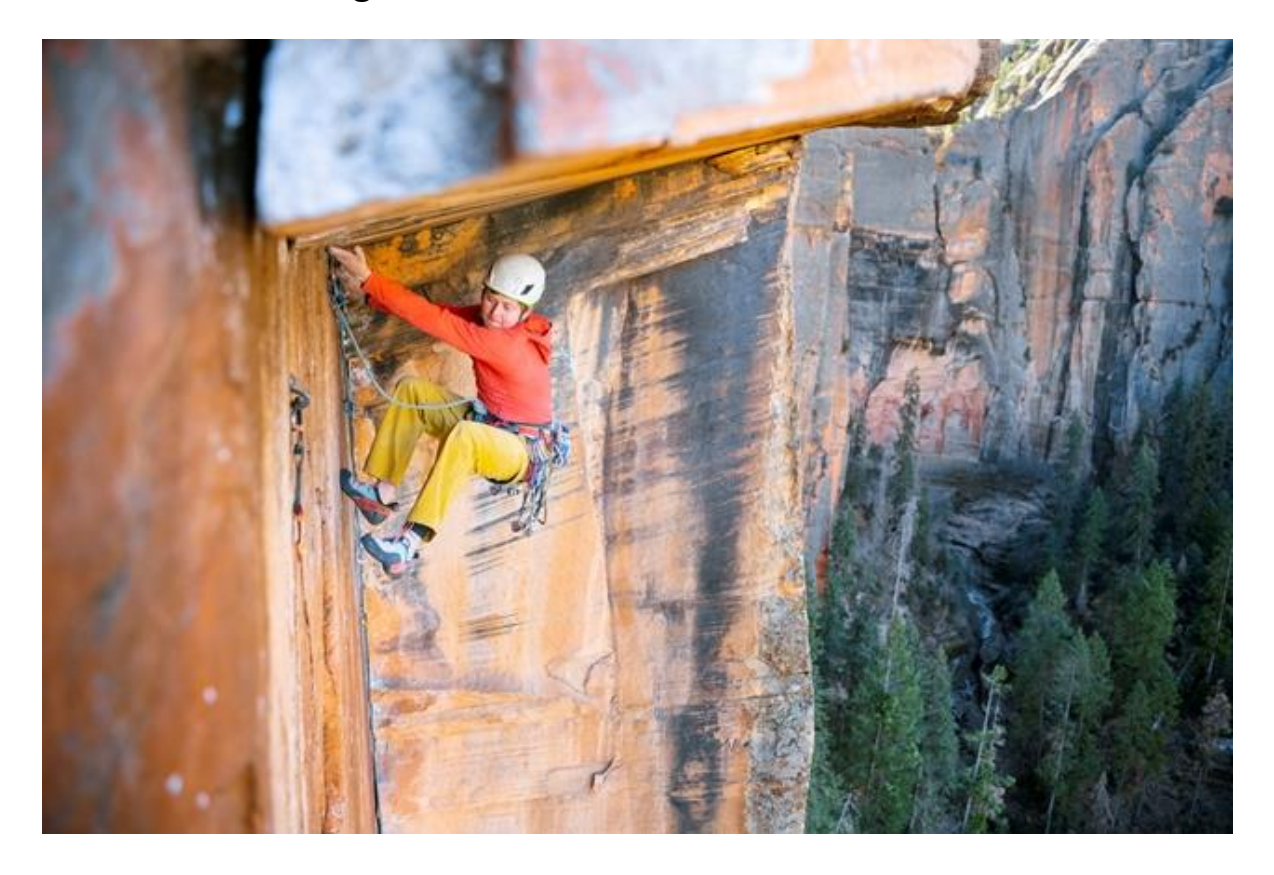
Sponsored by Arc'teryx | $2,000