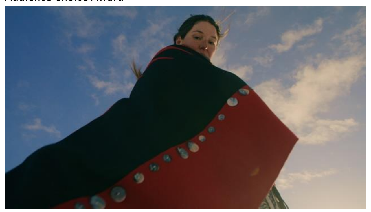
Sponsored by BUFF® | $2,000