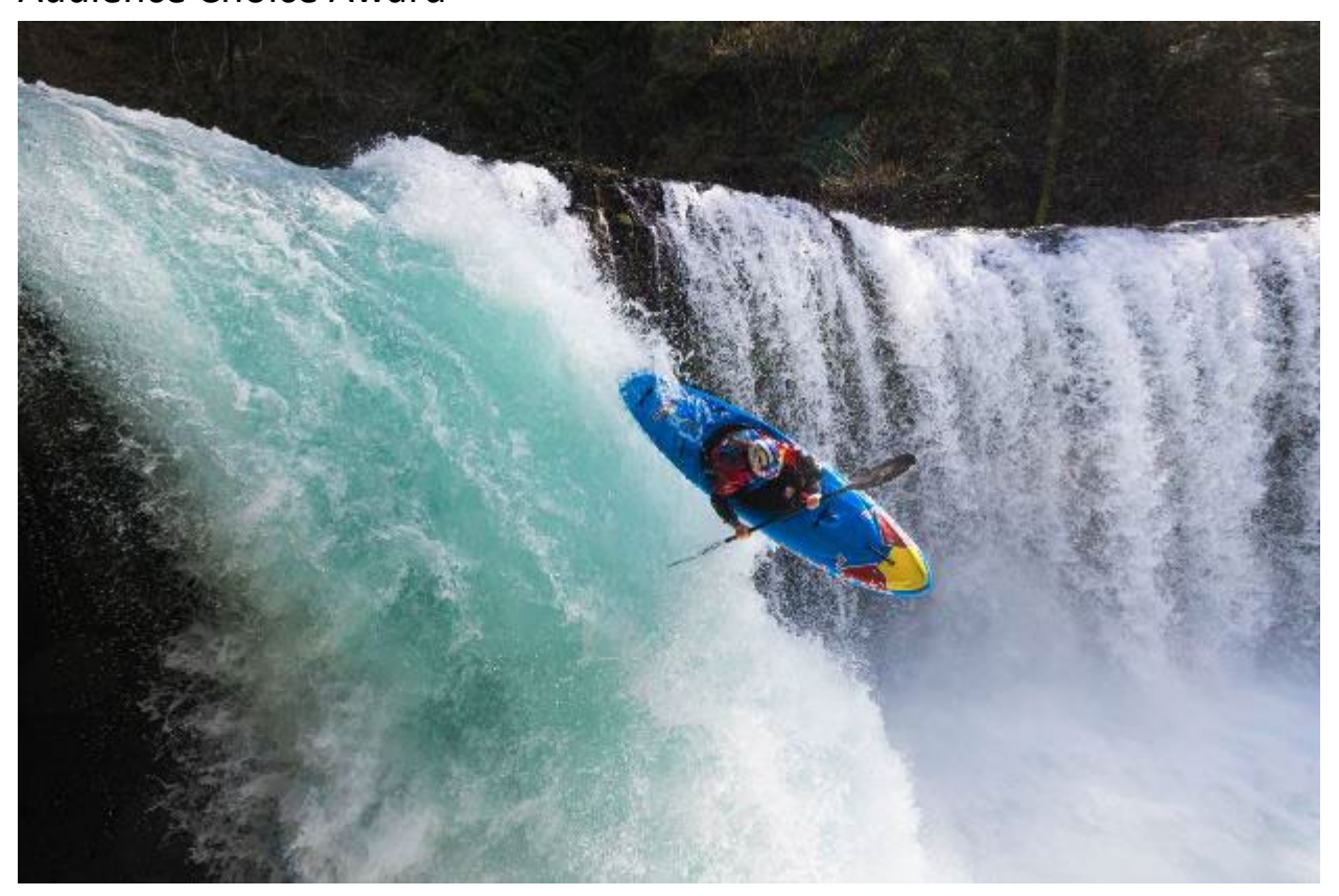
Sponsored by BUFF® | $2,500