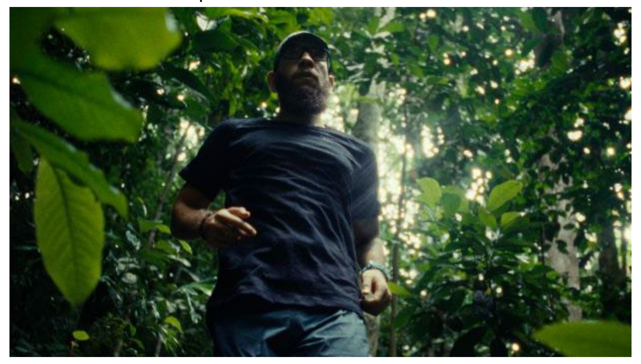
Sponsored by Mountain Hardwear | $2500