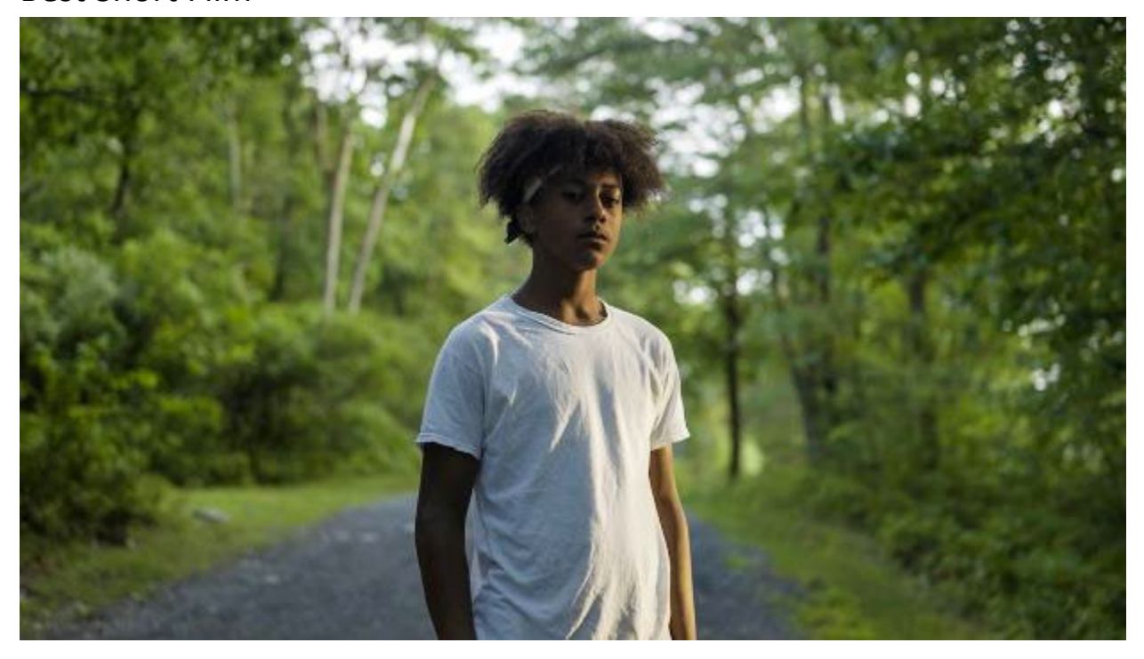
Sponsored by Banff Lodging Co. | $2500