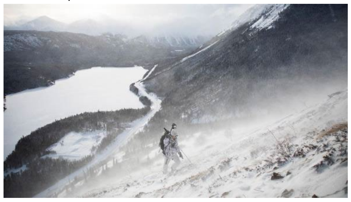
Sponsored by Happy Yak | $2500