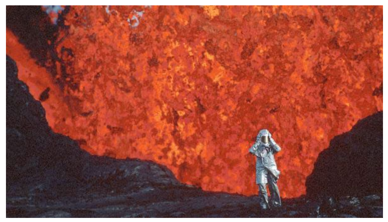
Sponsored by Wild Life Distillery | $2500