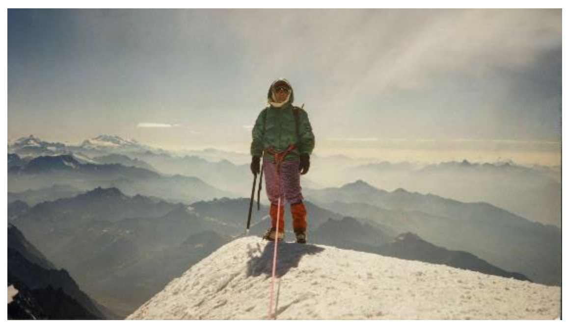
Sponsored by Helly Hansen | $2500