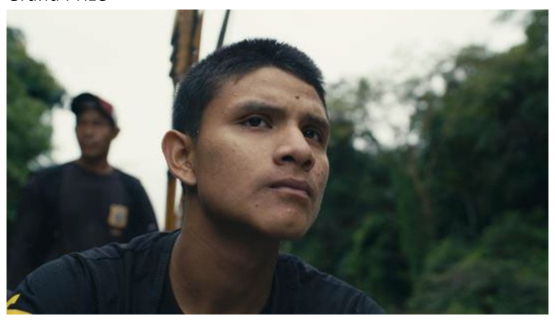
Sponsored by Doña Paula | $5000