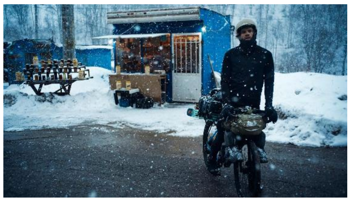
Sponsored by Mountain Joe | $2500