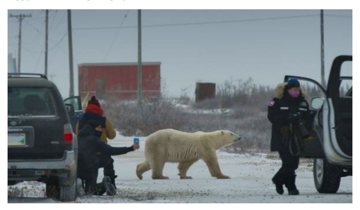
Sponsored by Mountain Equipment Company | $2500