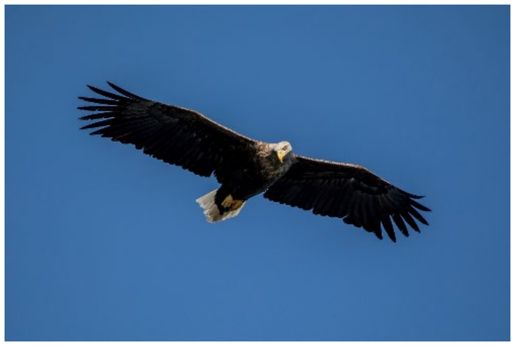
Sponsored by Mountain Equipment Company | $3000