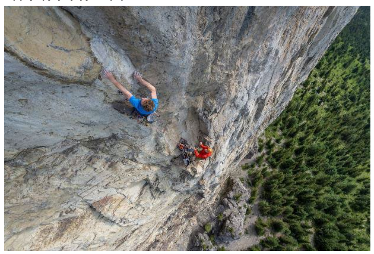
Sponsored by 11th Hour Racing | $3000