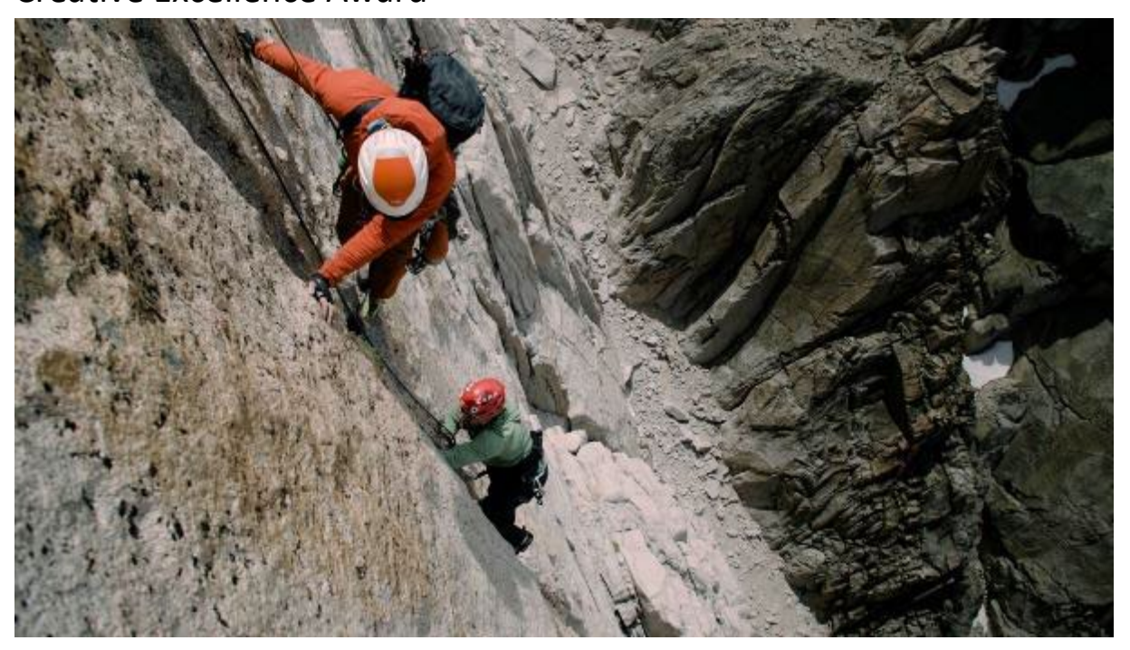
Sponsored by Core Values Cider Co. | $3000