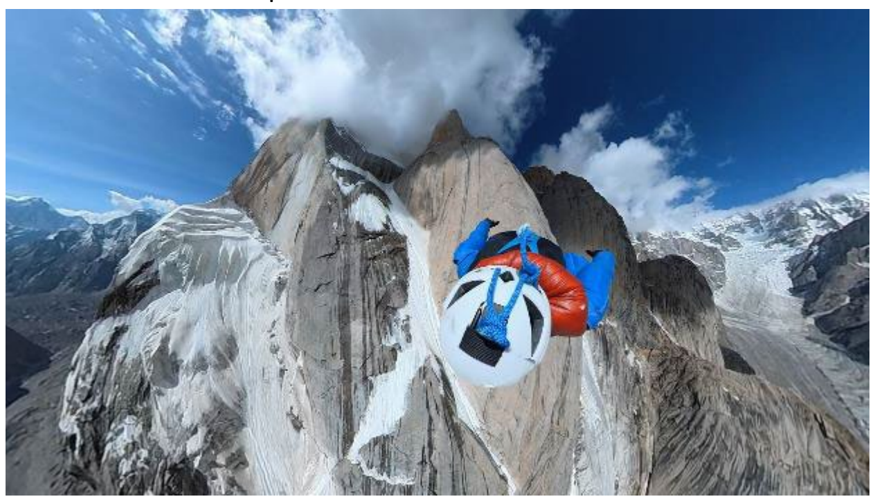
Sponsored by Herschel | $3000