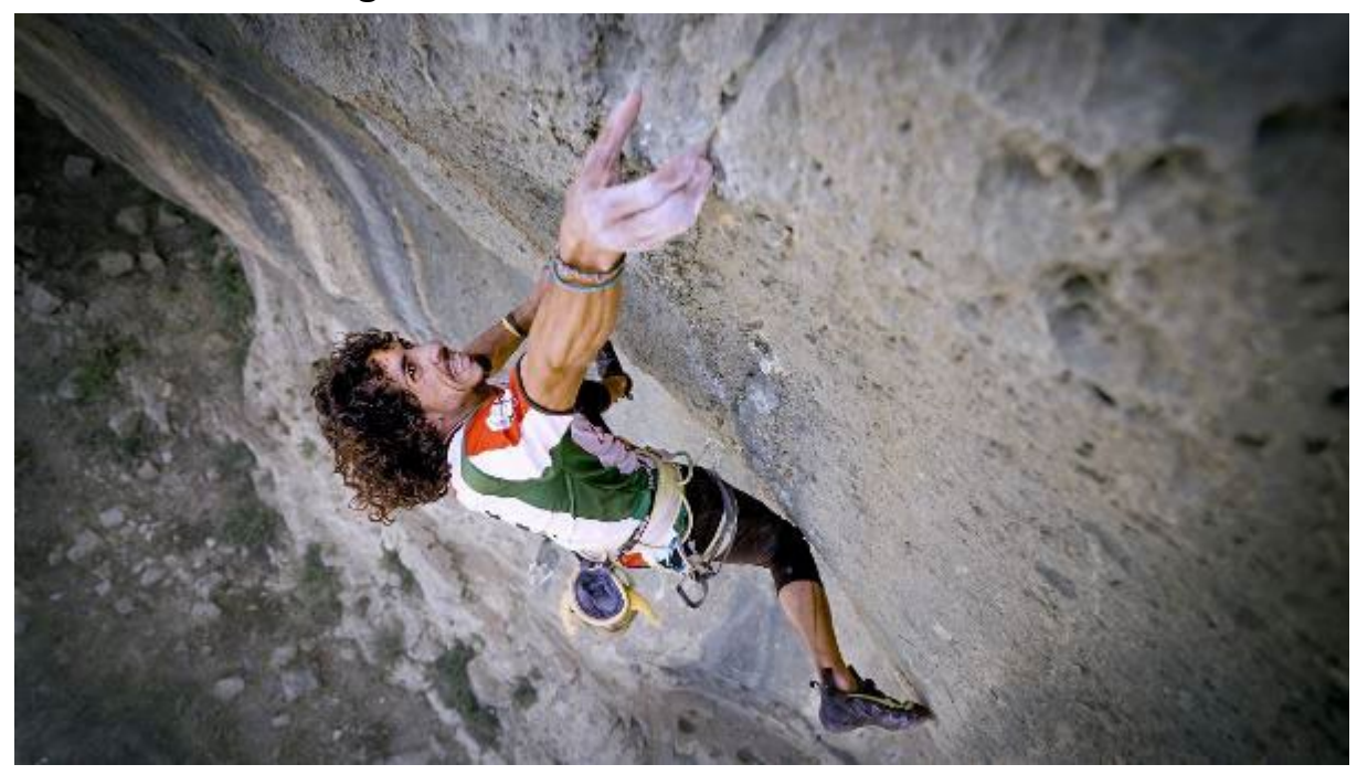
Sponsored by Arc'teryx | $3000