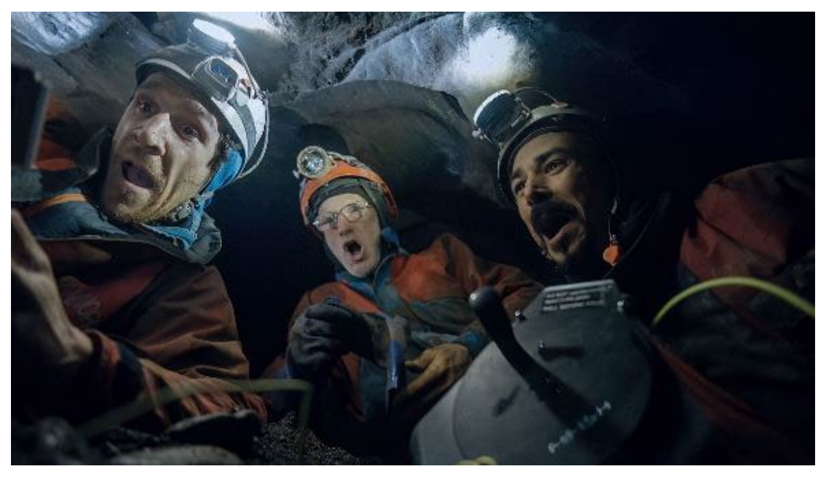
Sponsored by Aurora Expeditions | $3000