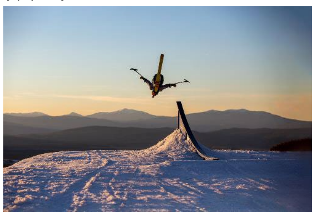
Sponsored by Doña Paula | $5000