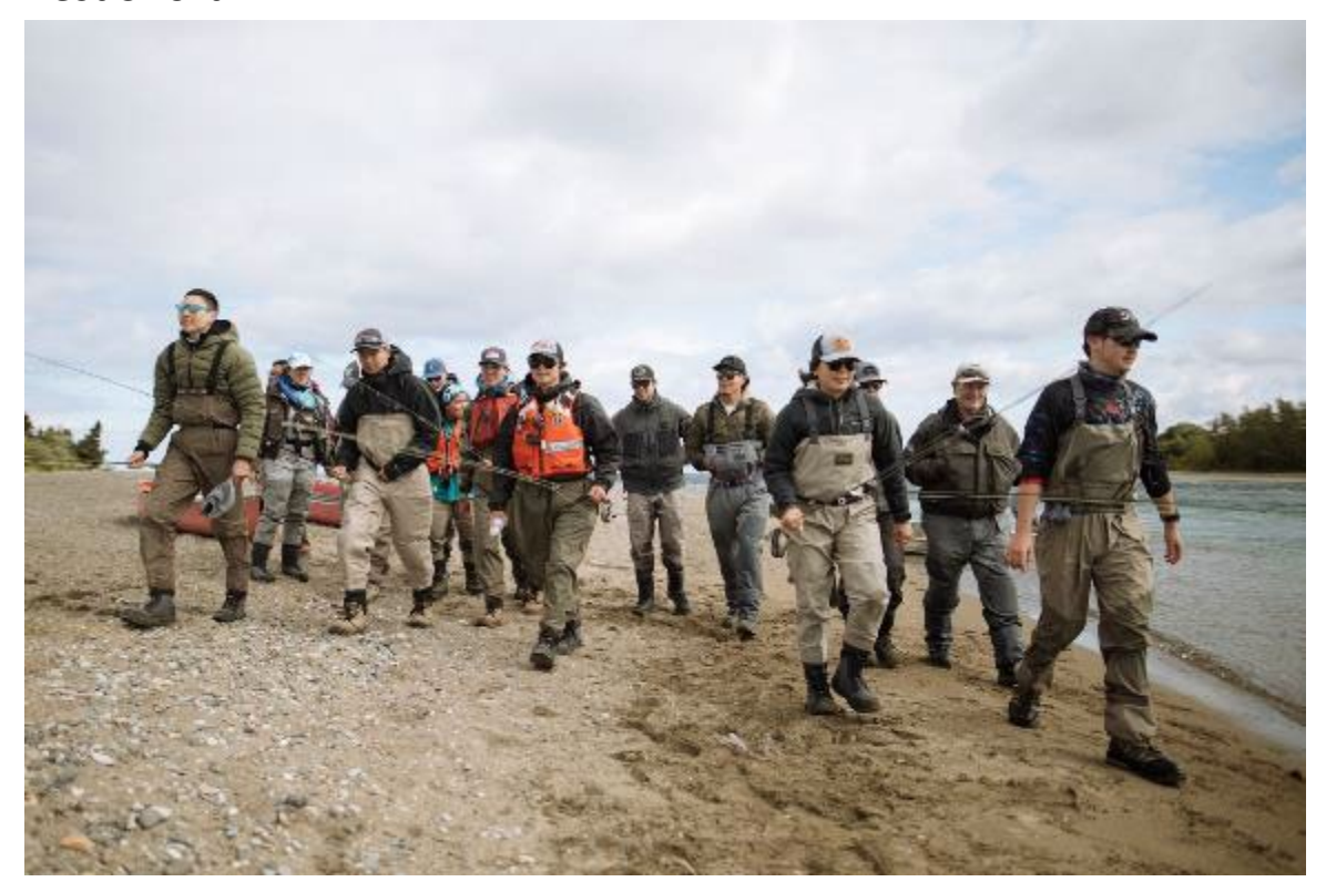
Sponsored by DUER | $3000