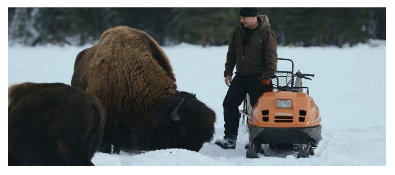
Sponsored by Helly Hansen | $3000