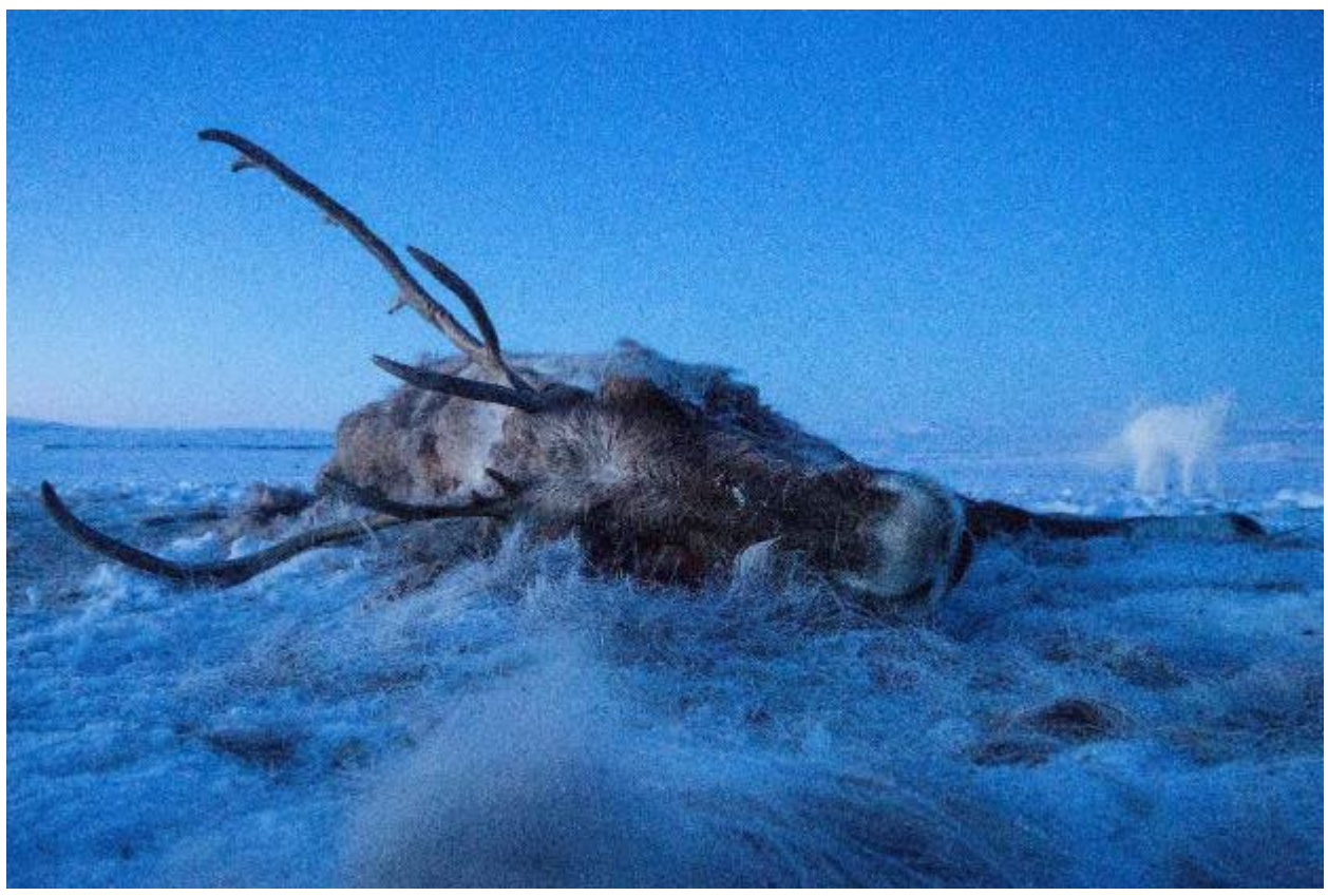
Mountain Ghosts