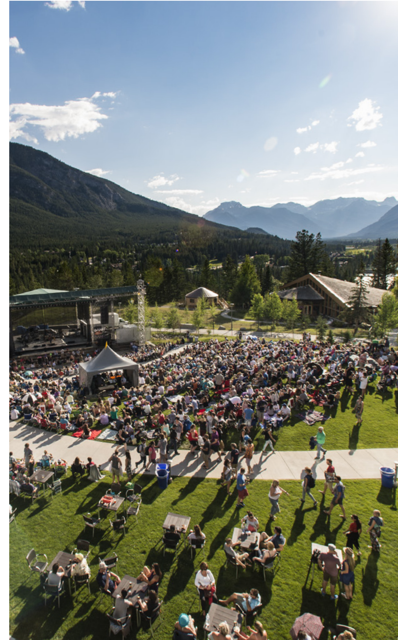
Banff Centre Shaw Amphitheatre event.