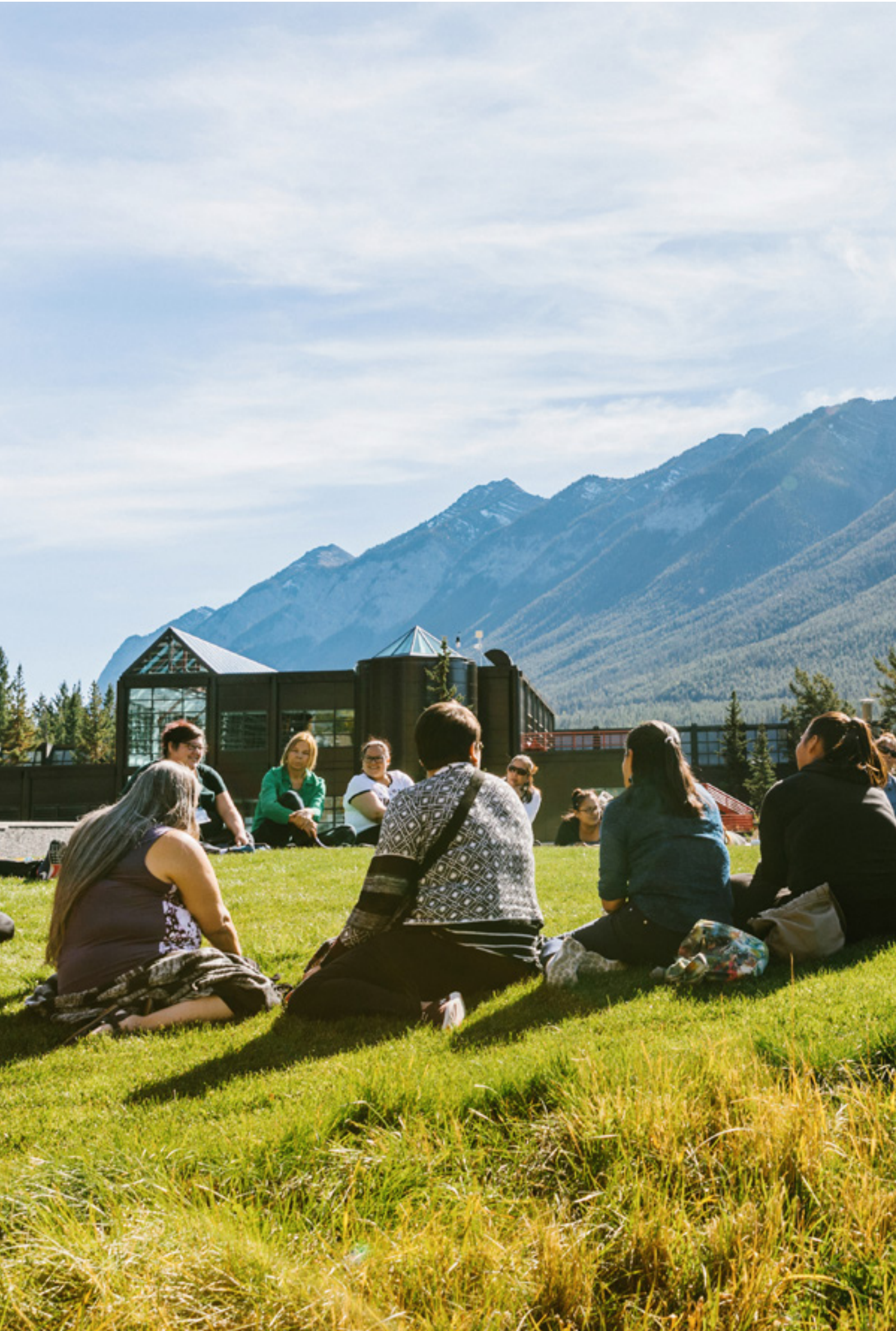
Indigenous Leadership program participants, Banff Centre.