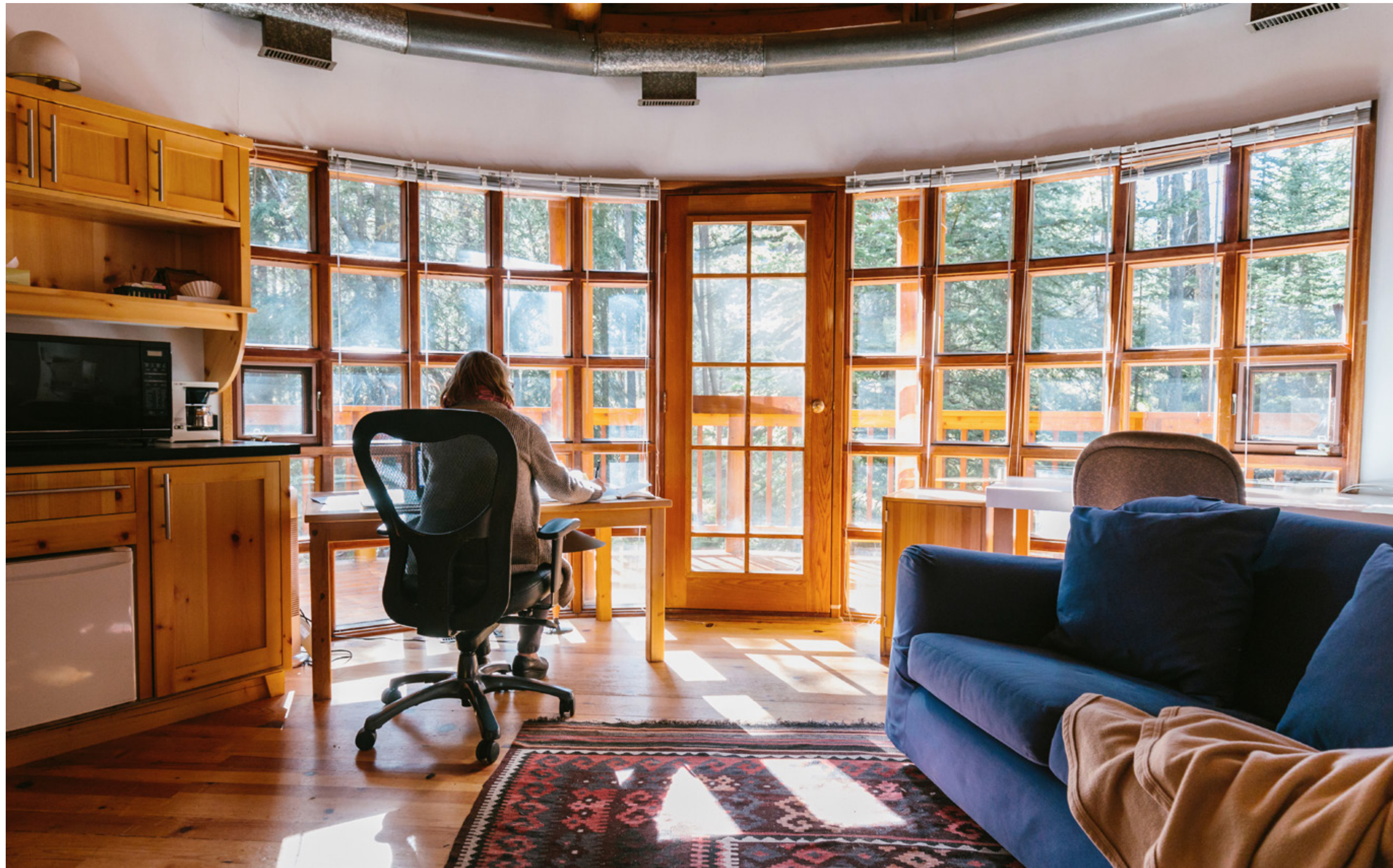
Inside the Hemingway Studio in the Leighton Artists Studios.