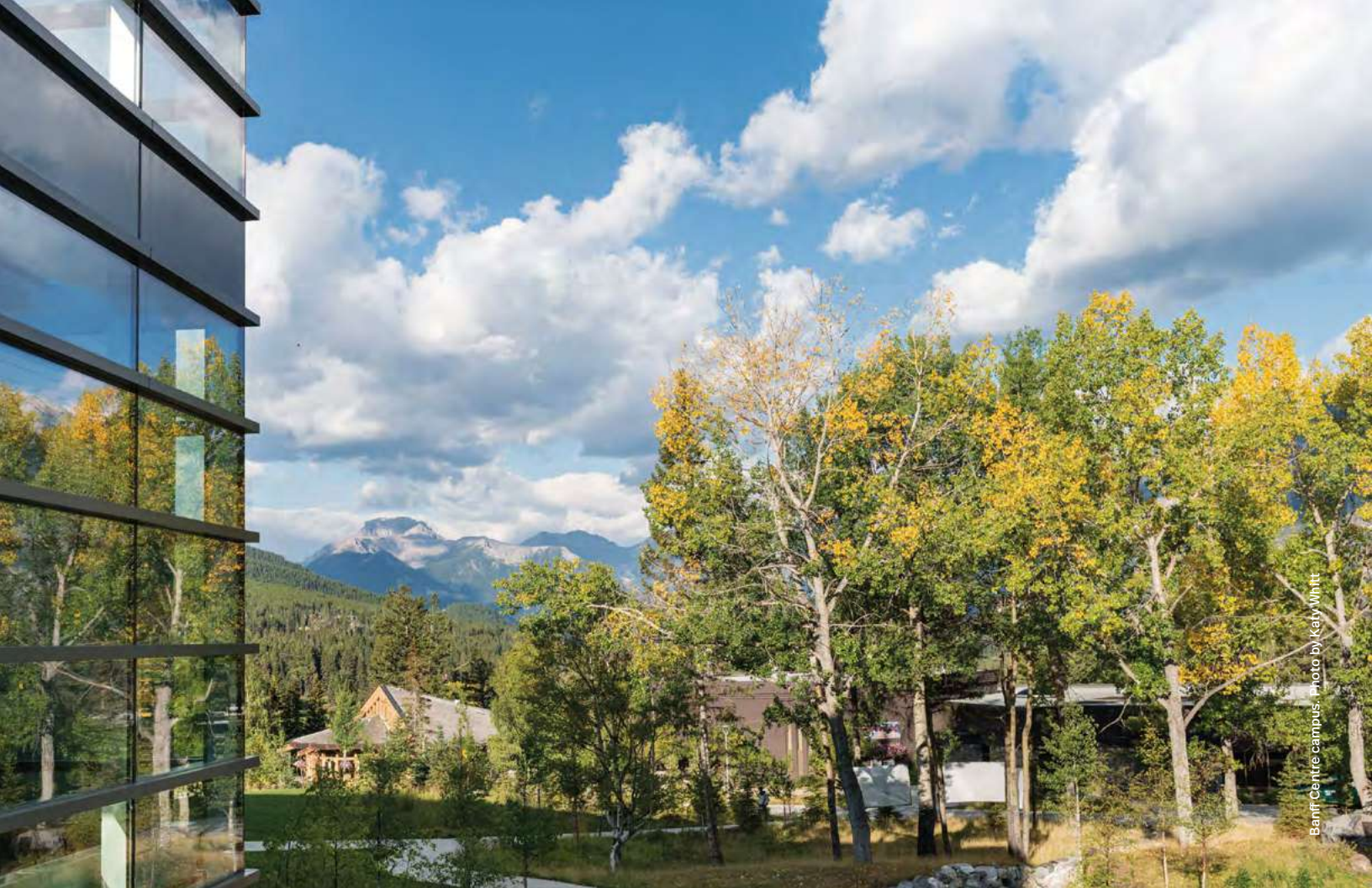
Banff Centre campus.