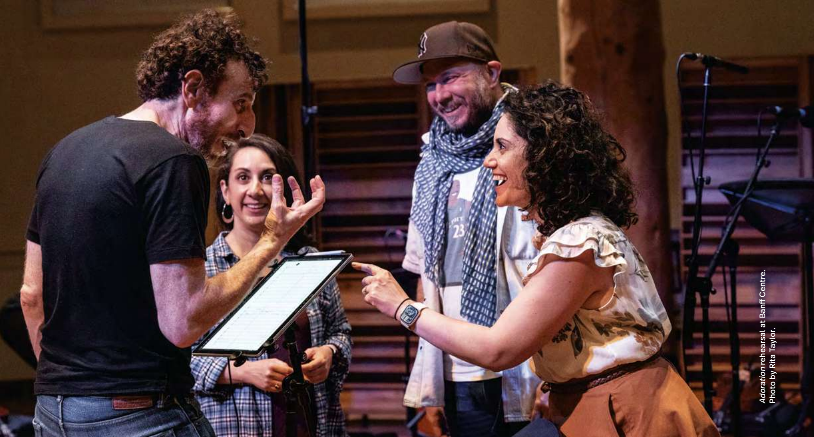
Adoration rehearsal at Banff Centre.